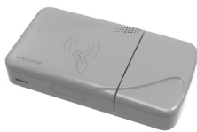
1x FridgiGuard Lock